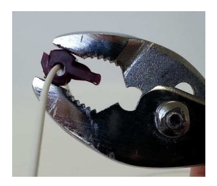
Finally, Plug in the insulated male connector into the T-tap:

Squeeze down on the T-tap until you here the latch click: